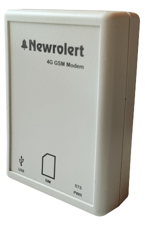
4G GSM Modem